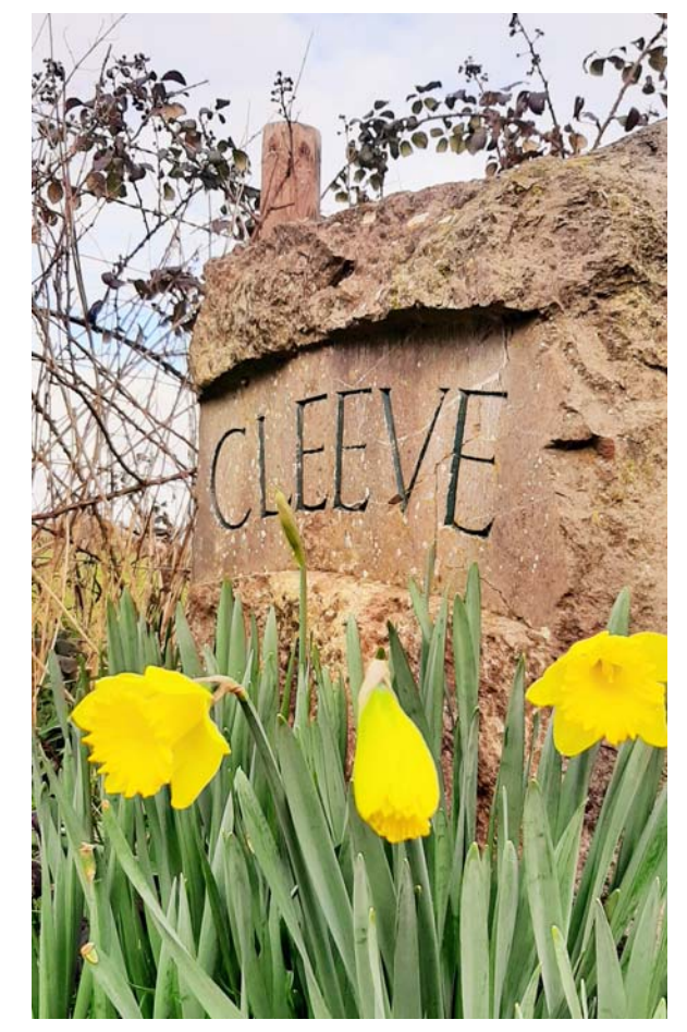
All About Cleeve is also available on line http://www.cleeveparishcouncil.co.uk/

Closing COPY DATE: 15th APRIL (for MAY 2023 issue.)